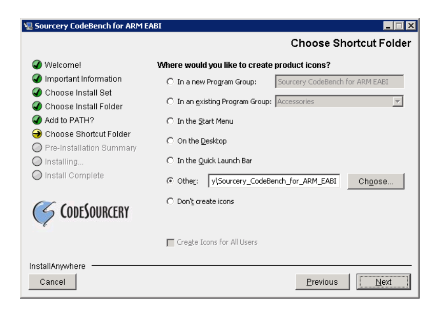
Choose Shortcut Folder. You can customize where the installer creates shortcuts for quick access to Sourcery CodeBench Lite.

When the installer has finished, it asks if you want to launch a viewer for the Getting Started guide. Finally, the installer displays a summary screen to confirm a successful install before it exits.